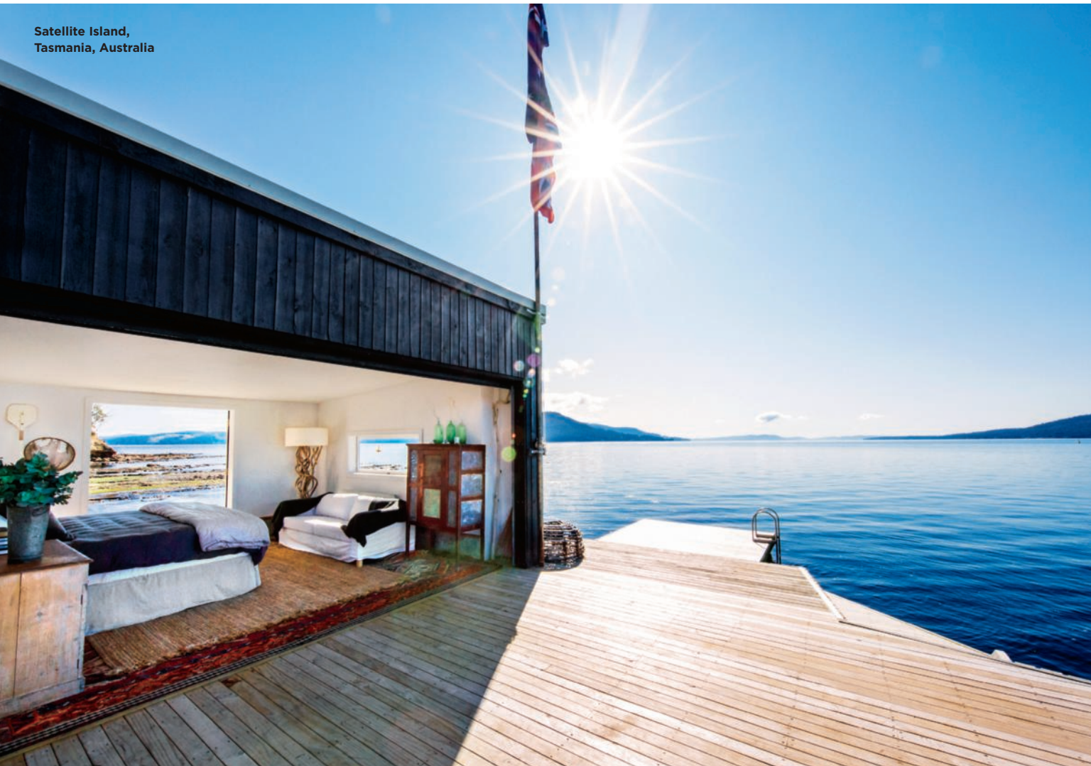
Satellite Island, Tasmania, Australia