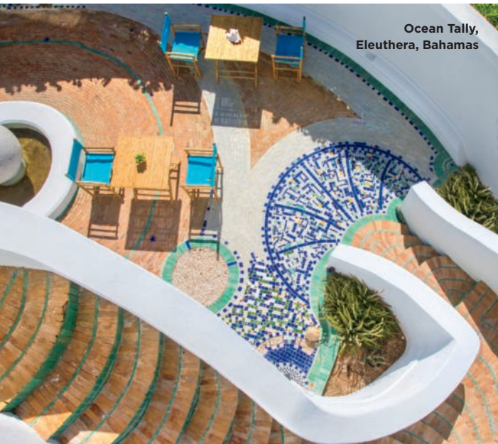
Ocean Tally, Eleuthera, Bahamas

Eleuthera, that wild, slender strand of coral and limestone that lies so far in kilometers and style from the buzz of Nassau, has slowly come into the spotlight for its exquisite beaches. And now, Ocean Tally's Morocco-influenced cluster of ocean-facing cottages makes overnights simply irresistible. Rates start at $375; oceantally.com.