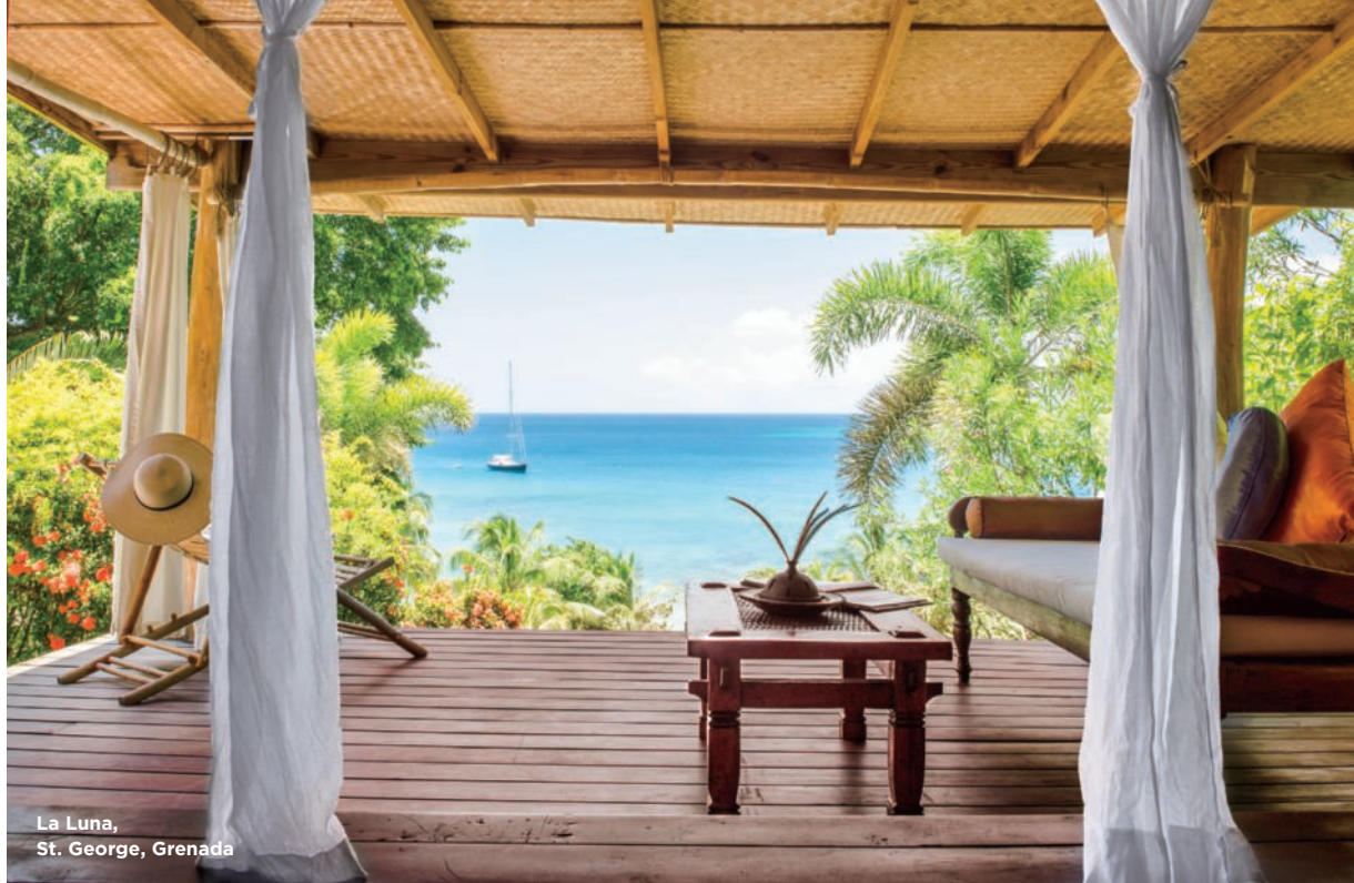
La Luna, St. George, Grenada

Post one Instagram shot, and your friends will either divorce you in jealousy or start frantically booking their flights to this exquisite isle. Everything's here—whitewashed stone houses, pink flowers, the cerulean Aegean—except the crowds. Complete the picture at the stunning Anemomilos Apartments. Rates start at $182; anemomilosapartments.com/hotel.