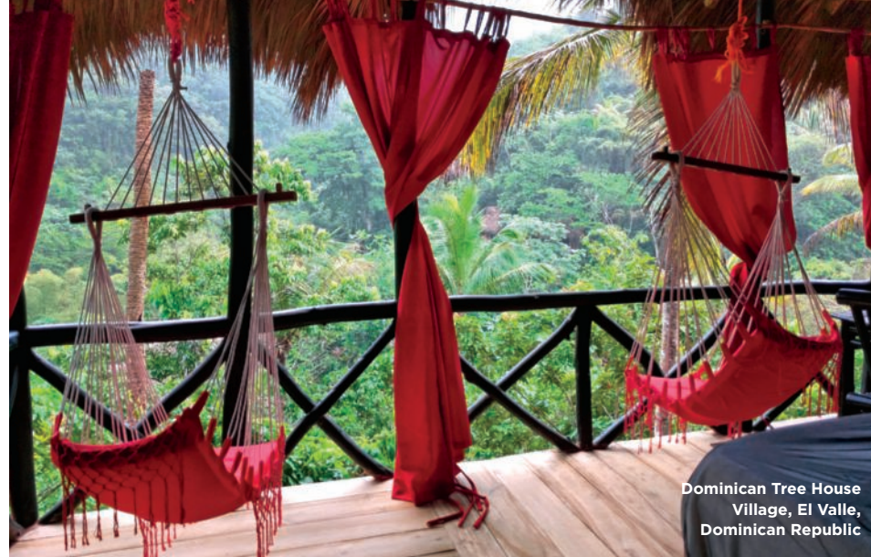
Dominican Tree House Village, El Valle, Dominican Republic