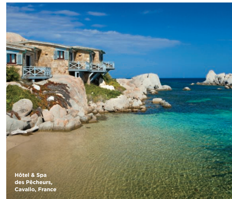
Hôtel & Spa des Pêcheurs, Cavallo, France