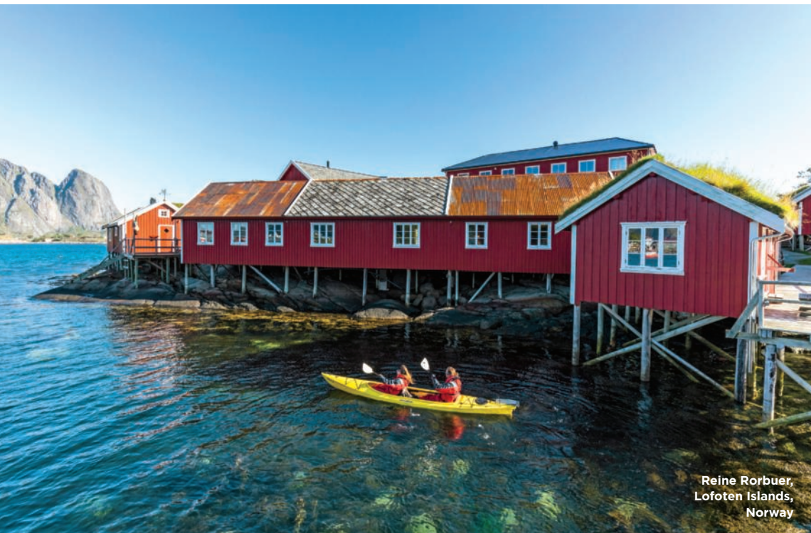
Reine Rorbuer, Lofoten Islands, Norway