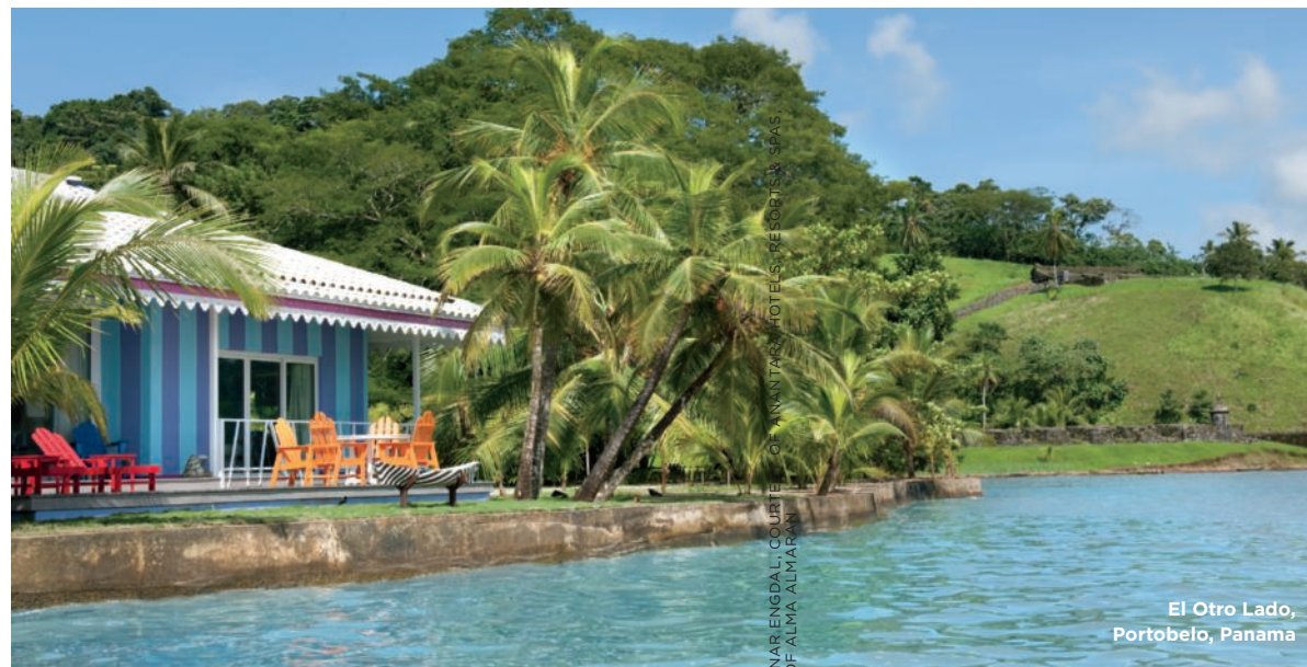
El Otro Lado, Portobelo, Panama

You've promised yourself a trip to the ends of the Earth, and this may be the best way to do it: amid the rugged, rocky splendor of this Scandinavian archipelago,