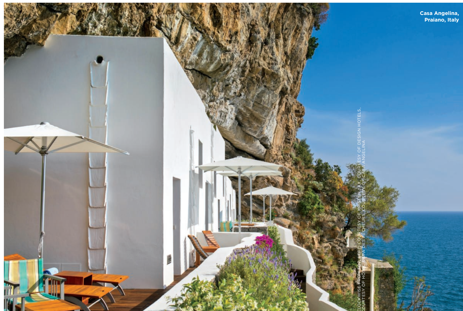
Casa Angelina, Praiano, Italy