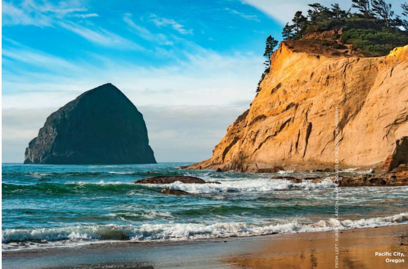
Pacific City, Oregon

Situated alongside a protected natural area on a stretch of Oregon coastline that, shockingly, remains an untapped (and relatively undeveloped) paradise, Headlands welcomes those seeking a quiet escape to a handsome, woodsy lodge that celebrates enduring coastal pastimes like beach bonfires and surfing. Rates start at $320; headlandslodge.com.