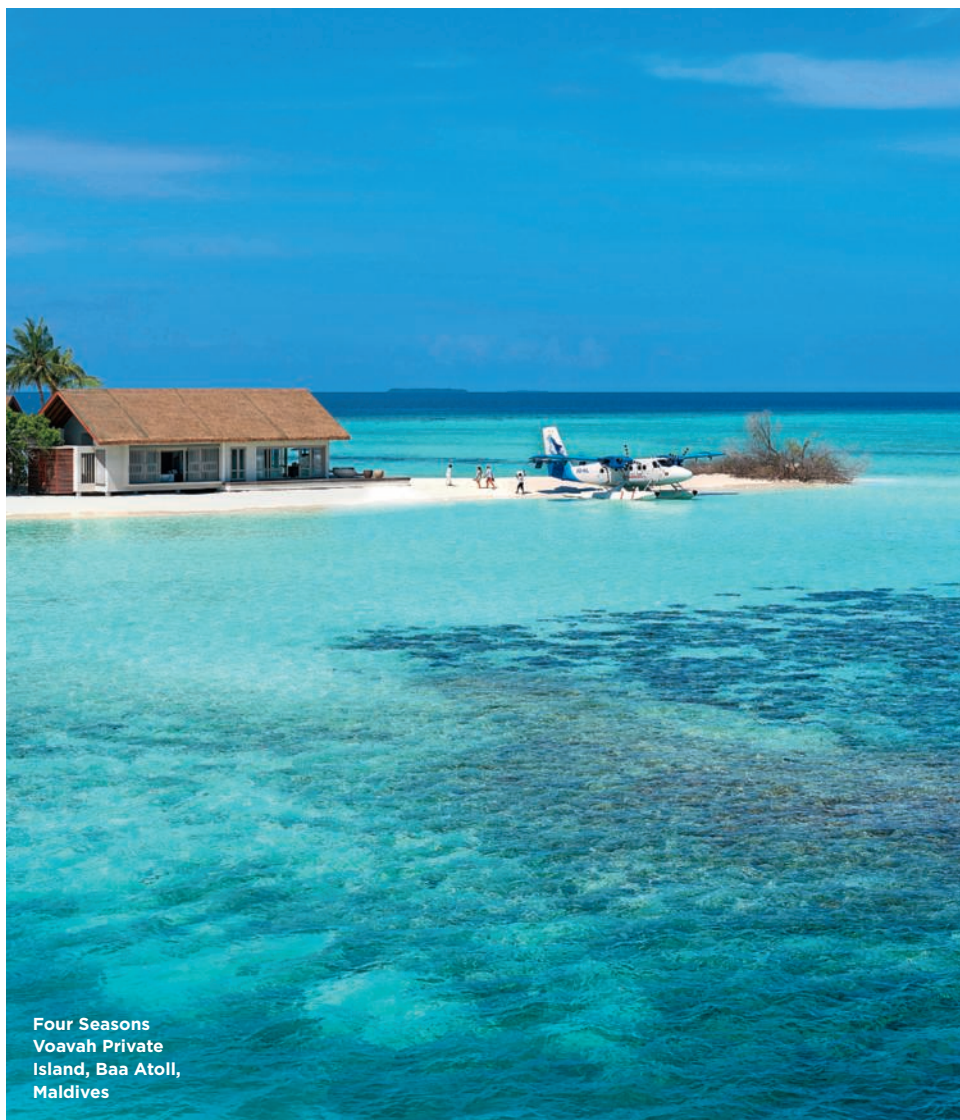
Four Seasons Voavah Private Island, Baa Atoll, Maldives