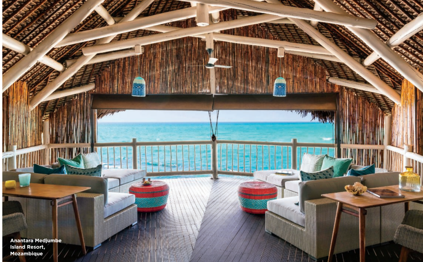
Anantara Medjumbe Island Resort, Mozambique