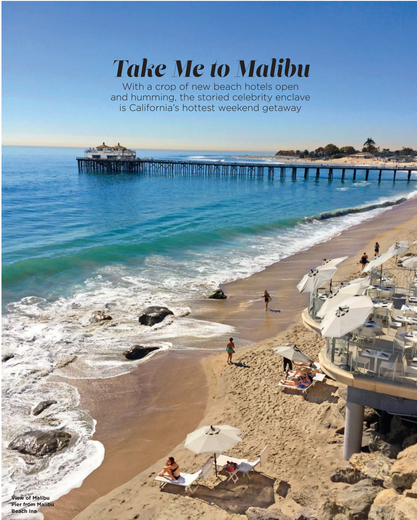
View of Malibu Pier from Malibu Beach Inn

With a crop of new beach hotels open and humming, the storied celebrity enclave is California's hottest weekend getaway