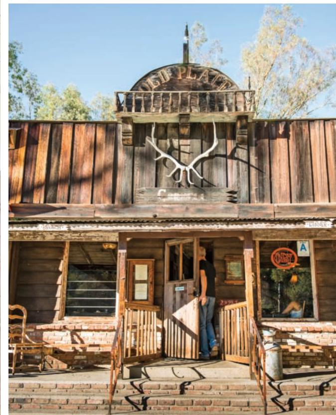
From far left: El Matador State Beach; sun hats and ceramics on offer at Ranch at the Pier; classic Western vibes at The Old Place