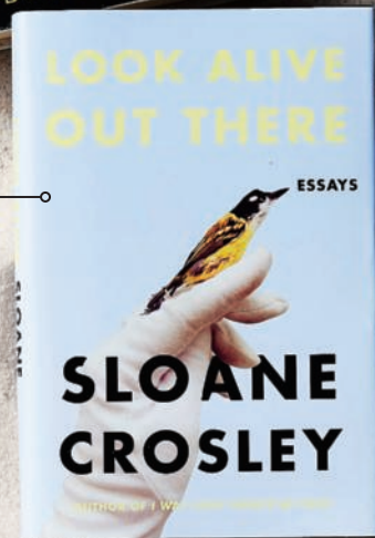
Look Alive Out There MCD Books/Farrar, Straus & Giroux (April 2018) SLOANE CROSELY

The witch Circe—infamous for turning Odysseus's sailors into pigs—is compassionately reimagined as a daughter, sister, lover, and friend in this addendum to the epic.