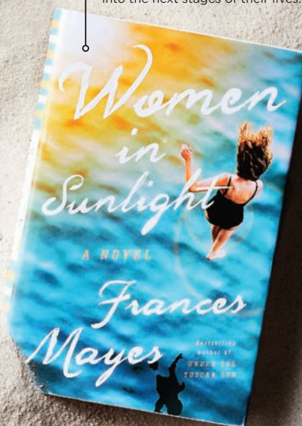
Women in Sunlight Crown (April 2018) FRANCES MAYES

This best-selling essayist shares vignettes of her life at home, in the wilds of Vermont, and abroad with the same funny, tongue-in-cheek tradition as the likes of Nora Ephron and David Sedaris.