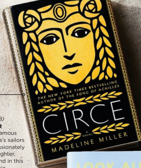
Circe Little, Brown and Company (April 2018) MADLINE MILLER

A newcomer to a resort island dives into the sparkling world of the 1950s elite, only to find herself caught in a catastrophe that takes years to unravel.